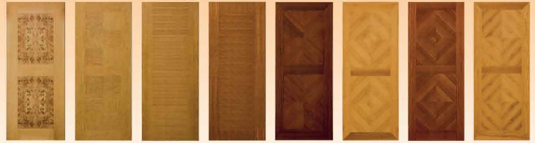
DK16-01 DK16-02 DK16-03 DK16-04 DK16-05 DK16-06 DK16-07 DK16-08